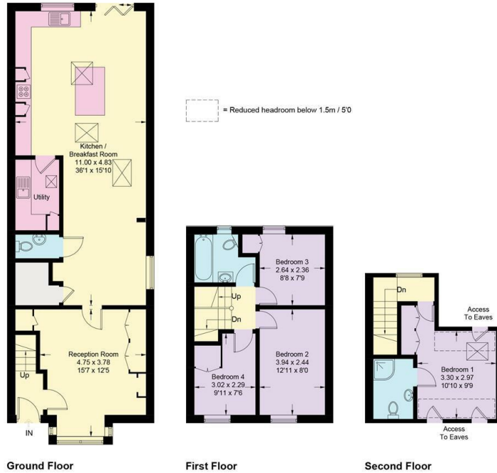
Illustration for identification purposes only, measurements are approximate, not to scale. Fourlabs.co © (ID1215973)